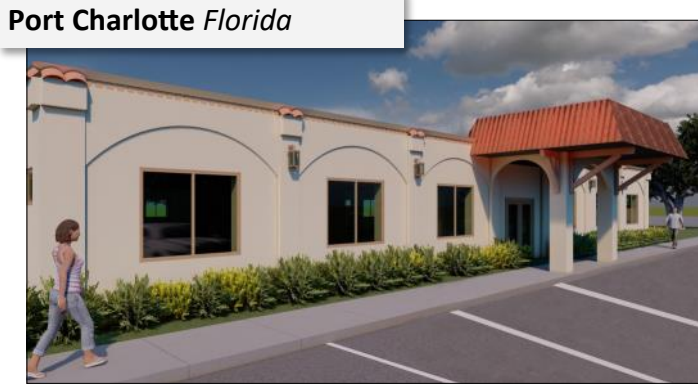
Social Security Administration