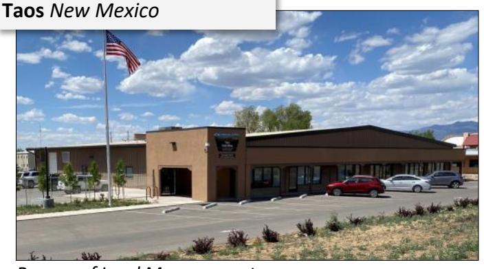
Bureau of Land Management