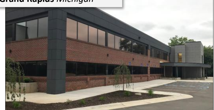
Social Security Administration ODAR