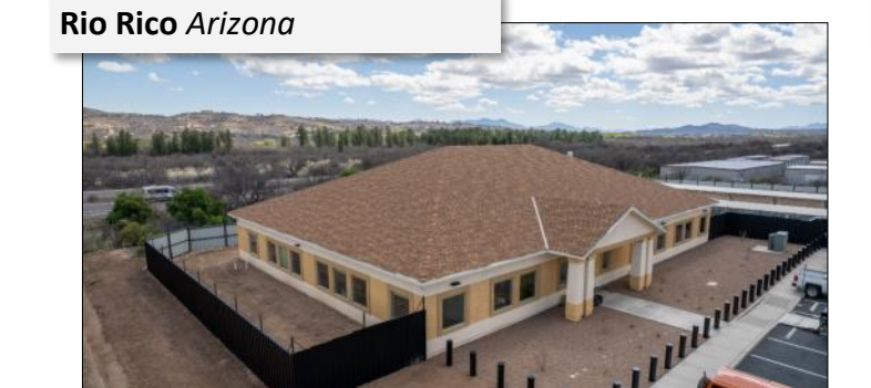
Department of Justice